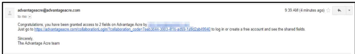
Figure 3: The collaborator will be sent an e-mail with a link to the shared field(s). Clicking on the link will prompt the collaborator to sign into Advantage Acre or create an account to access the field(s).

By clicking the link in the e-mail, the collaborator will be taken to the sign-in page of Advantage Acre. Here, collaborators can sign-in if they have an existing account or create a new account. Once logged into Advantage Acre, the field(s) created and shared will appear in the collaborator's account.